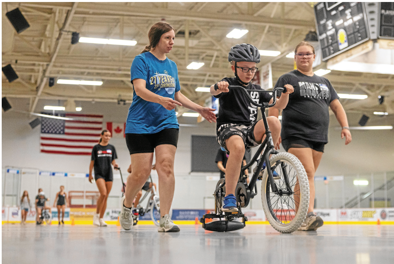
TANNER ECKER, TRIBUNE